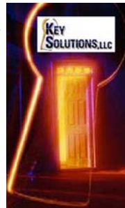
Discover Our Million Dollar Wholesaling Trade Secrets