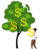
We Help You Make Millions With Your Wholesaling Business